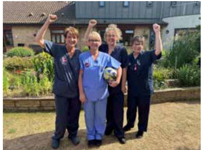
Hospital clinical team excited for a summer of football

Find out how you can support St Elizabeth Hospice's Care. It's coming home here: