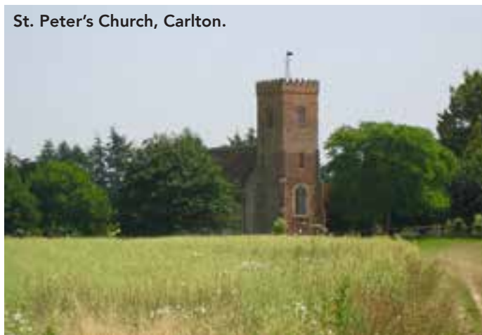
St. Peter's Church, Carlton.

This issue was designed, printed & published by Leiston Press.