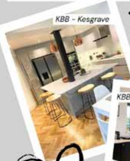
KBB - Kesgrave