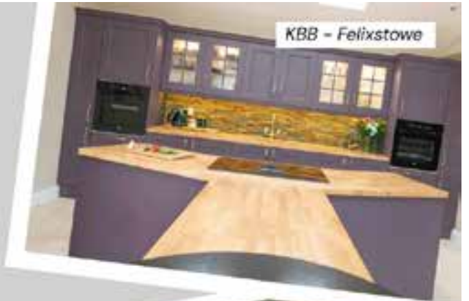
KBB - Felixstowe

The central hub of the home. From cooking prep to casual dining to storage, the kitchen island can do it all and add an architectural feature point to your kitchen too. Whether you dream of somewhere to sit with a glass of wine in the evening or want to create a spot for nightly homework, gourmet meals, or morning coffee, a practical and beautiful island will be the most used area in your house. We can help find the right island for your space. Make your home something to shout about!