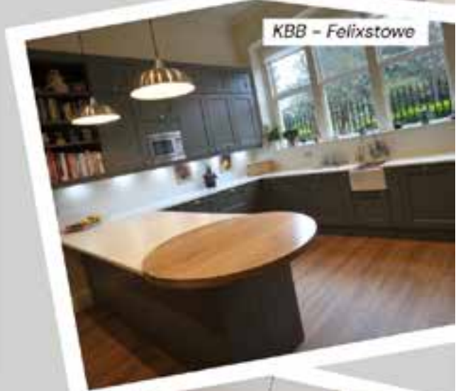
KBB - Felixstowe