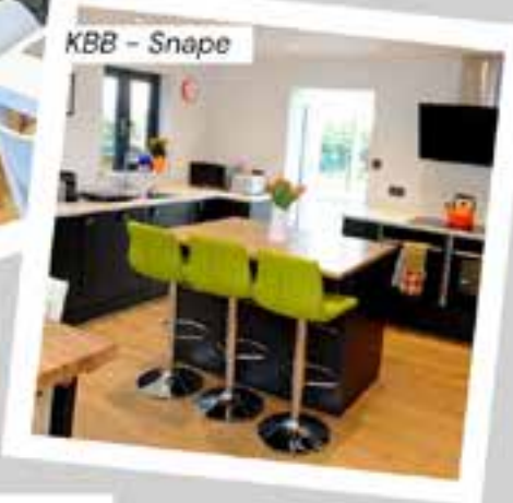
KBB - Snape