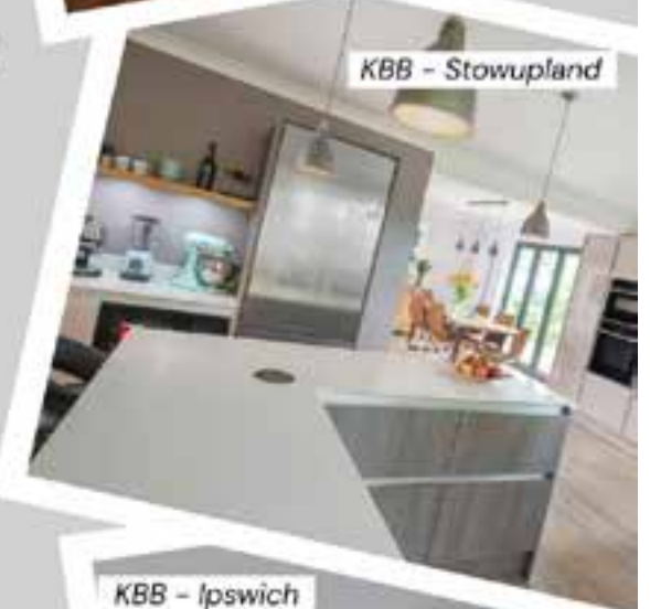
KBB - Stowupland