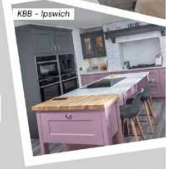
KBB - Ipswich