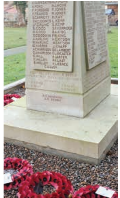
Leiston War Memorial with the names.