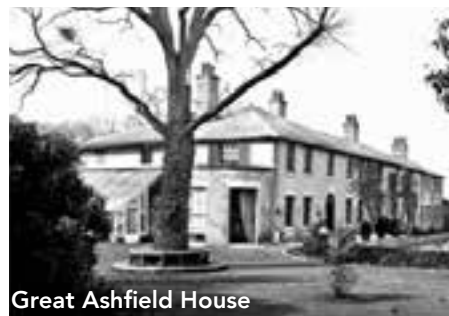
Great Ashfield House