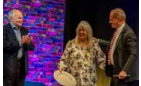
Clive Anderson (L) with Alison Steadman receiving her award from John Lloyd (R)