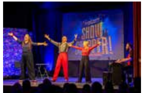
Showstopper! The Musical curtain call