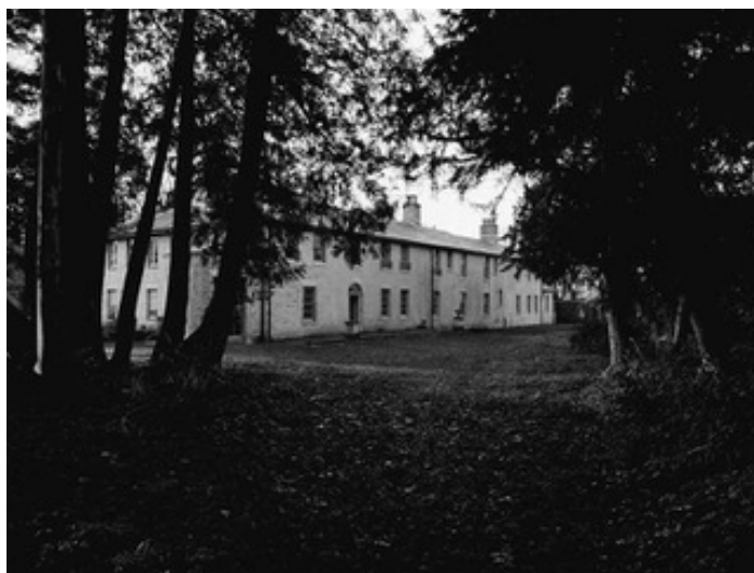
Great Ashfield House

The talk takes place on Monday 20th October at 2.30pm, in person at the Fromus Centre, Street Farm Road, Saxmundham, IP17 1AL (behind the library). The talk starts at 2.30pm. No need to book, just turn up. £1 for members, £3 for visitors, including tea/coffee/biscuits. Good, free car-parking. The speaker will be present in person, and the talk will NOT be on Zoom.