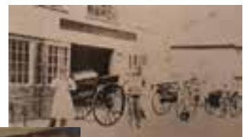
Yoxford Village Hall