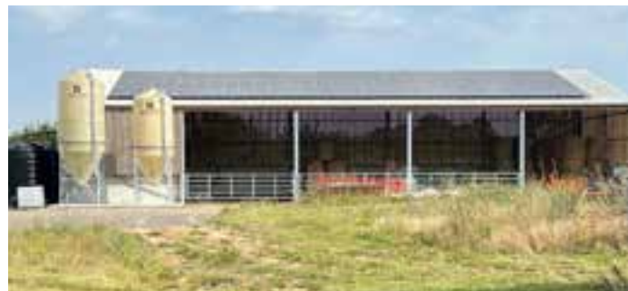
Rooftop solar panels on a farm building

In some cases, food production can even continue. So, in fact, solar generation can support food security. With additional planting and management, which should always be prioritised in any solar scheme, it can also increase the abundance of insects and other plants and animals.