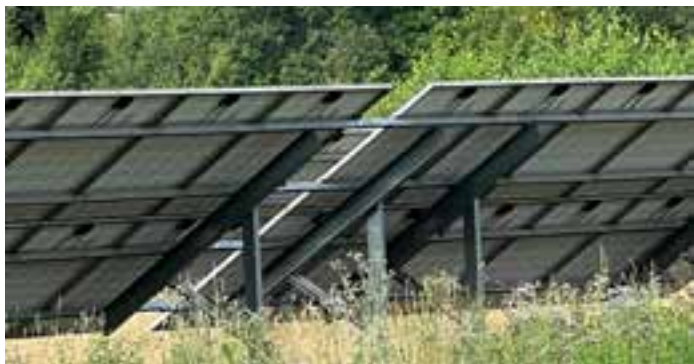
Ground-mounted solar panels on a farm in East Suffolk

The government plans to triple solar generation by 2030. Suffolk, as a largely flat agricultural county, can expect to see a good proportion of this generation. Large solar farms (over 50 MW) are decided by national government. Smaller applications go to the District Council for approval. These need to satisfy statutory consultees, and to meet planning 'tests' against national planning policy. There may be good reasons to refuse a mega-solar farm if it is placing an undue burden on a host community. The views of communities are always taken into account, but ultimately any application can only be refused on the recommendation of a statutory consultee, or failure of the planning tests. A particular preference of this Council is more small-scale Community Energy solar schemes which are planned and owned by the community, bringing electricity and any excess profits directly to residents in the host parish.