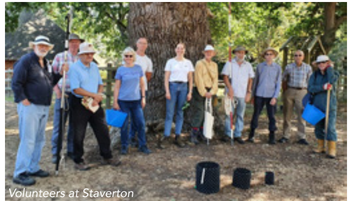
Volunteers at Staverton