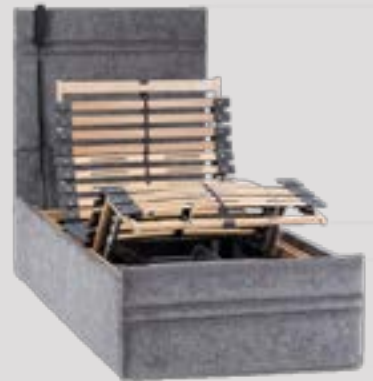
Adjustable beds, divans, upholstered frames and mattresses all made in our Ipswich factory