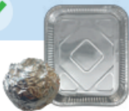
Aluminium foil and trays - roll foil into a ball