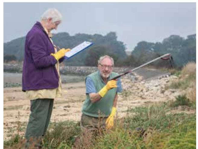
Coasts & Heaths.