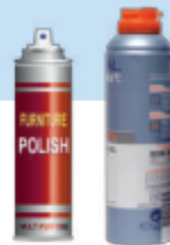
Empty aerosols - no paint, fertilizer or weed killer