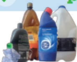
Plastic bottles - empty, wash, squash and lid on