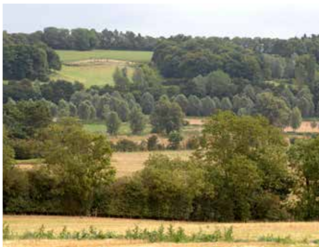
Dedham Vale.

The Coast and Heaths and Dedham Vale AONBs are two protected landscapes and make up part of the 46 strong family of AONBs nationwide