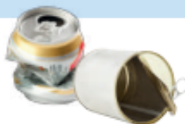
Food and drinks cans