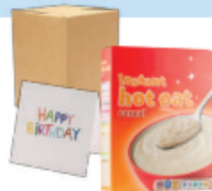
Cardboard, clean food packaging, boxes and cards