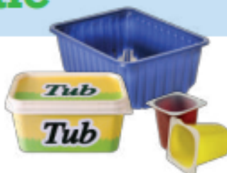
Plastic yoghurt pots, tubs and food trays