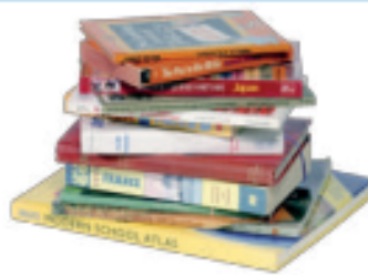
Books, paperback and hardback