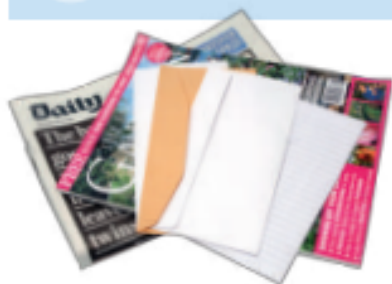
Paper, newspapers, magazines and junk mail